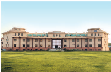
JaganNath Gupta Institute of Engineering and Technology Jaipur, Rajasthan