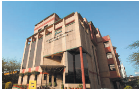
JaganNath International Management School Kalkaji, New Delhi