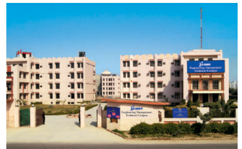
JIMS Engineering Management Technical Campus Greater Noida, U.P.