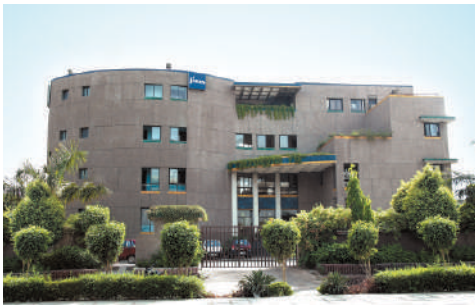
Jagan Institute of Management Studies Sector-5, Rohini, New Delhi