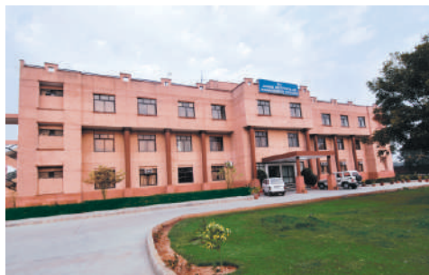
Jagan Institute of Management Studies Jaipur, Rajasthan