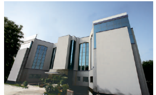
JaganNath International Management School Vasant Kunj, New Delhi